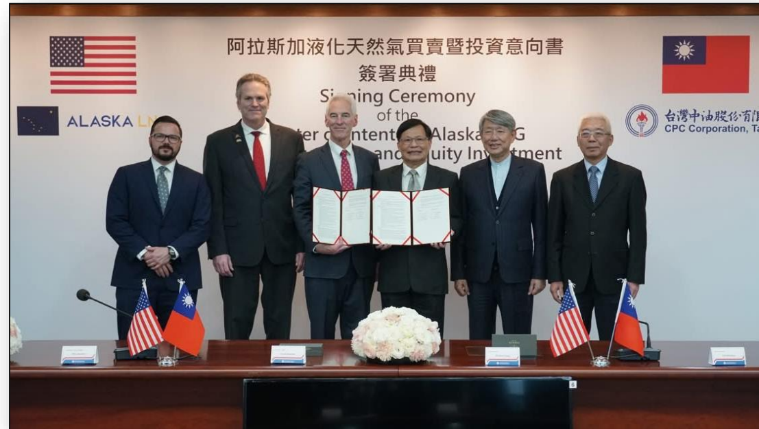
Taiwan President Lai Ching-te

“Alaska is a source of high-quality natural gas. It’s relatively short distance from Taiwan facilitates transportation. We are very interested in buying Alaskan natural gas because it can meet our needs and ensure our energy security..”