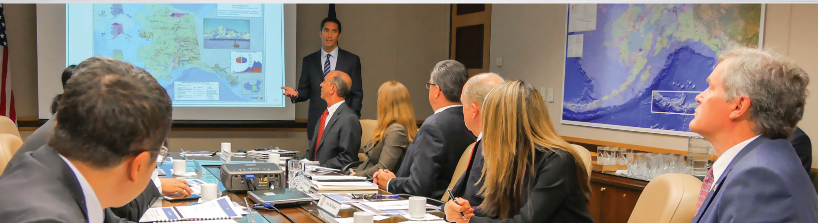
PHOTO: Representatives from one of Asia’s largest oil & gas companies meet with AGDC and State of Alaska officials in Anchorage in July 2017.